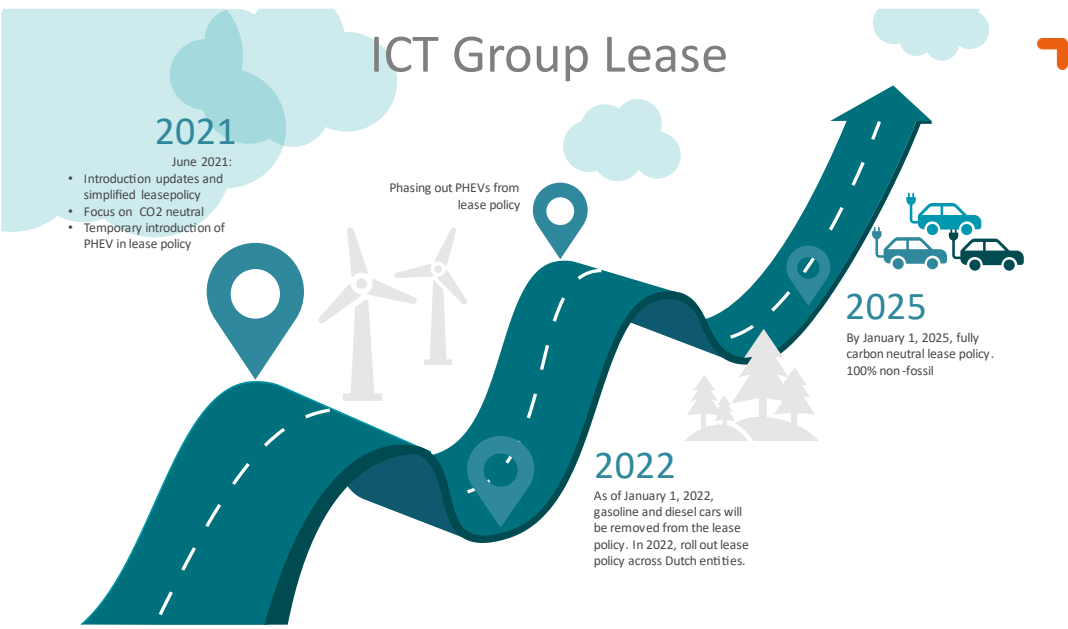
Figure 1 Roadmap leased car policy

For the buildings, the reduction program is now being developed. The main focus is on mobility, as the fossil fuelled leased cars are the main contributors to CO2 emissions. In order to reduce fossil fueled lease cars, a new lease policy has be introduced. The schedule of implementation is shown in Figure 1 Roadmap leased car policy.