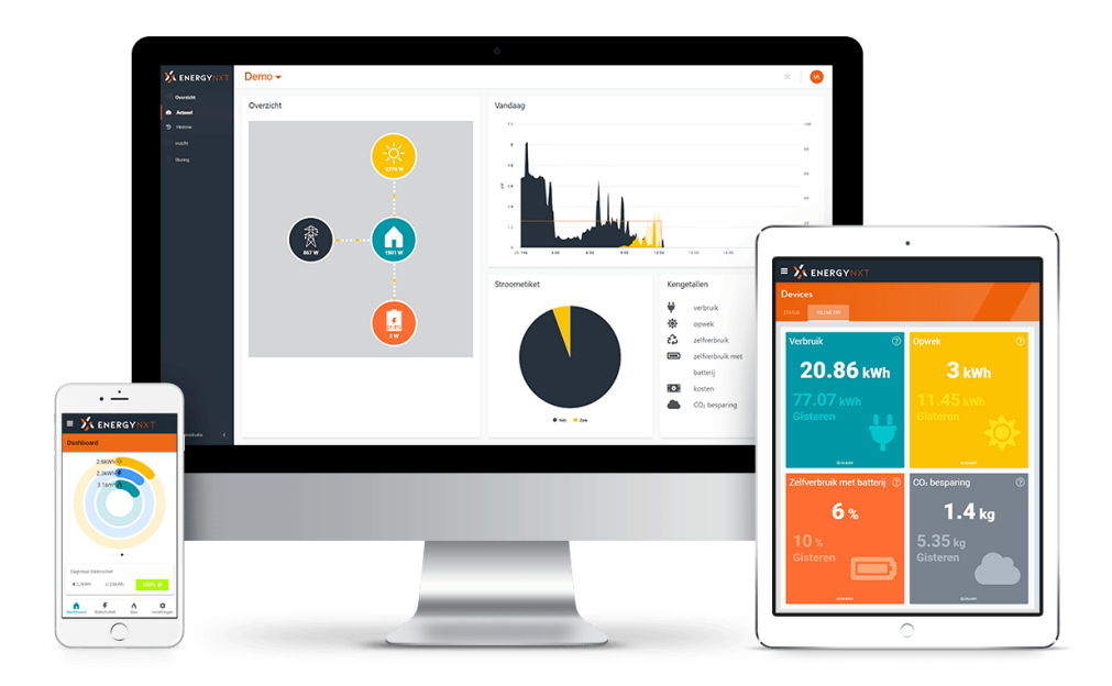
Figure 1: The EnergyNXT dashboard

The LES developed within TROEF will be partly based on an existing platform called EnergyNXT. This is an energy-specific internet-of-things platform. The platform provides better insight into an organization's use of energy and creates opportunities for smart deployment and harmonization of energy production and use. The results are immediate: substantial savings in terms of energy and CO<sub>2</sub> emissions, and therefore lower energy bills. An additional benefit is the increased stability of the network.