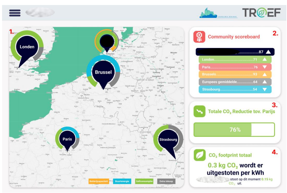
Figure 5 Community dashboard