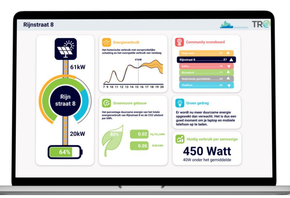
Figure 4 Building dashboard

OrangeNXT co-developed mockup dashboards specifically for TROEF (see Figure 4 Building dashboard and Figure 5 Community dashboard). Also data flows where designed and implemented.